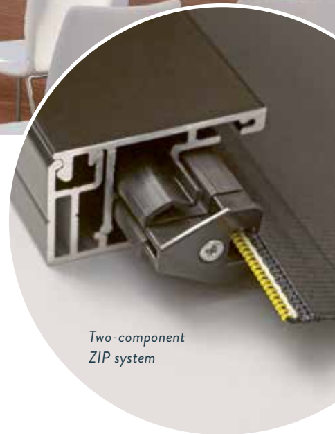
Two-component ZIP system